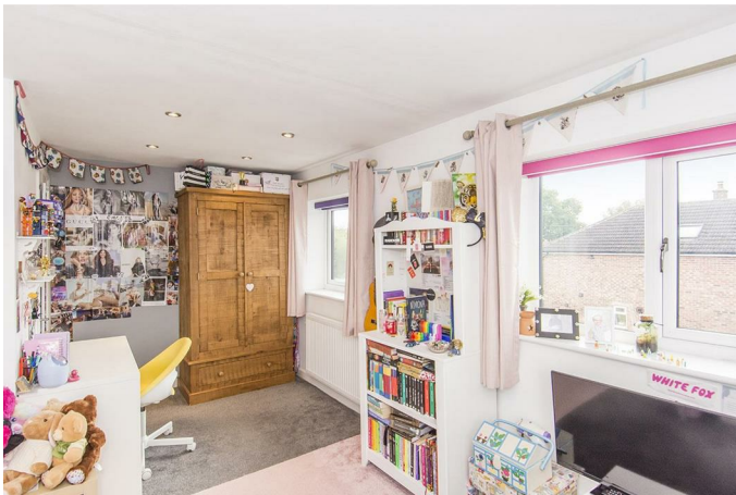
Bedroom Two Photo Three