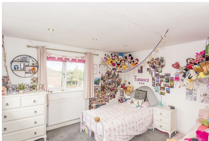
Bedroom Two 15'10" x 12'11" (max) (4.83m x 3.94m (max))

A double bedroom with three windows to both the front and side aspects. (This was originally two separate bedrooms but is now being used as one larger bedroom, however this can easily be converted back. )