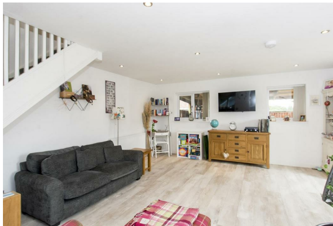
Open Plan Living/Dining Room 16'8" x 17'2" (min) (5.08m x 5.23m (min))

This spacious open-plan living space has three windows to the front and side aspects allowing lots of natural light flood in. There is a set of French doors that open into the garden. There is luxury vinyl flooring and two radiators. The stairs rise to the first floor accommodation.