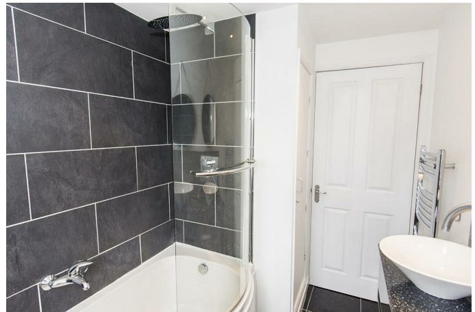
Bathroom Photo Two

The bathroom is fitted with a low-level WC and two circular wash hand basins set onto a bespoke drawer unit with mixer taps over . The bath has a shower over and is fitted side screen. Ceramic wall and floor tiling . There is an opaque window to the rear aspect. Chrome heated towel rail. There is also a cupboard that houses the gas central heating boiler.