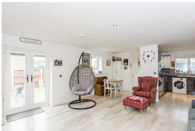
Open Plan Living & Dining Photo Two

This spacious open-plan living space has three windows to the front and side aspects allowing lots of natural light flood in. There is a set of French doors that open into the garden. There is luxury vinyl flooring and two radiators. The stairs rise to the first floor accommodation.