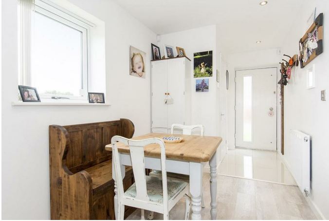
Dining Area Photo