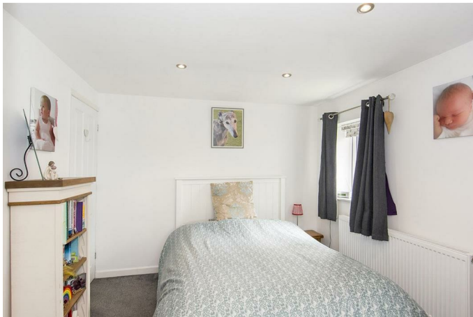
Bedroom One 9'7" x 14'11" (2.92m x 4.55m)

This double bedroom has dual aspect windows and a radiator. There is ample room for wardrobes and bedroom furniture. A door opens into the en-suite,