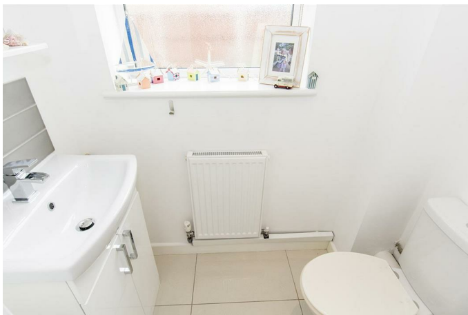
Cloakroom 3' x 5'6" (0.91m x 1.68m)

Fitted with a low-level WC and a hand wash basin set onto a vanity unit. There is ceramic tiled flooring and a radiator. An opaque window to the side aspect.