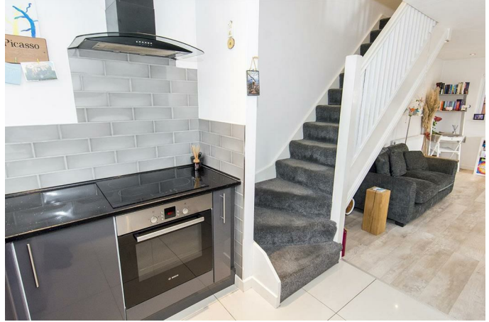
Kitchen Photo Two